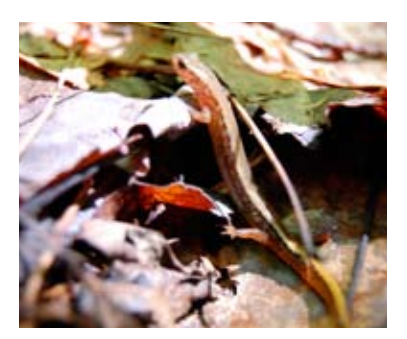
Northern red back salamander

Examine the stumps. Can you guess if they were hardwood or softwood?