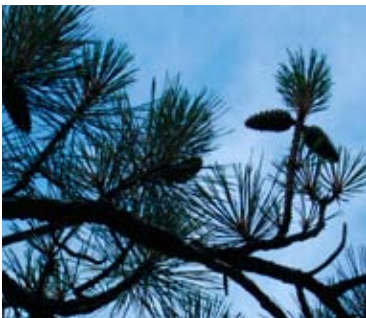
Pitch pine needles, bark, and cones