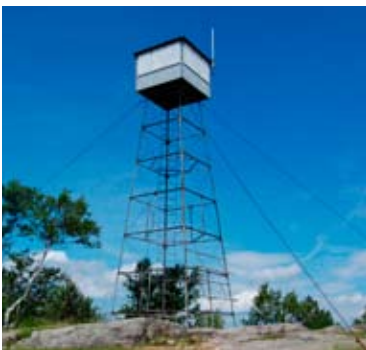
Pleasant Mountain Fire Tower, installed in 1920

end of Moose Pond, almost due south of the woodland. Slightly to the southwest, a smaller beaver pond peeks out from the rolling hills. Does the view make you want to build a house here? For many people, it does. In southern Maine, this natural community is often targeted for development because of its hilltop settings. However, the shallow soils will not support intensive residential use.