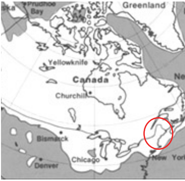
The maximum extent of glacial ice during Pleistocene time (2 million years ago to 10,000 years ago)