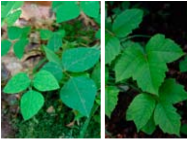
Hog peanut (L), with smooth leaf edges, not to be mistaken for poison ivy (R)