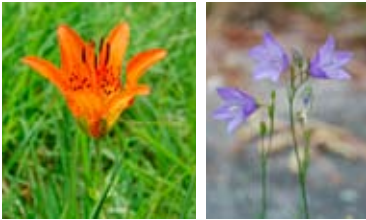
Turk's cap lily (L), harebells (R)