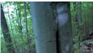
Beech with beech bark disease (top), healthy beech (bottom)