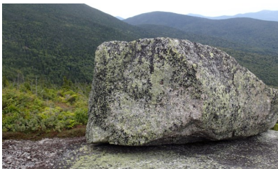
Glacial erratic on the south slope of Saddleback Mountain.