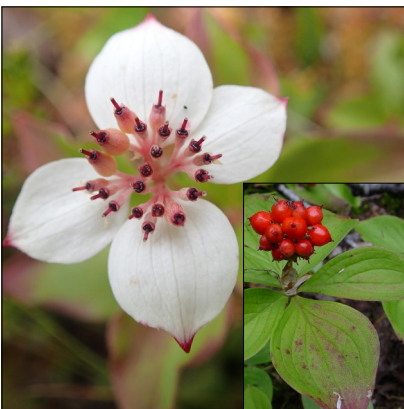
Bunchberry flowers and fruits. These berries are consumed by a variety of wildlife species including deer, moose, grouse and many others.

Whether in flower or fruit, bunchberry can be hard to miss.