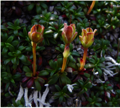
Fleshy leaves and mat forming growth patterns help cushion-plant ( Diapensia lapponica ) grow in difficult alpine conditions.