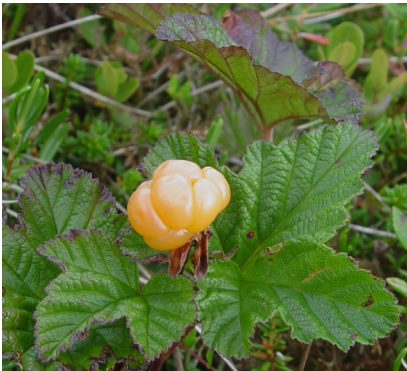
Cloudberry plants make a single fruit each year with a distinctive, tart taste.