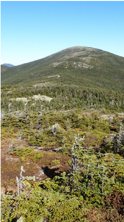
View from The Horn across Saddleback's alpine ridge.

fresh human consumption, but have been used to make jams and wines.