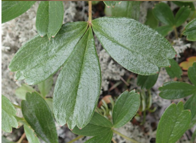
Capsules(above) and leaves (below) of three toothed cinquefoil.