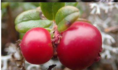
Leaves and fruit of mountain cranberry.