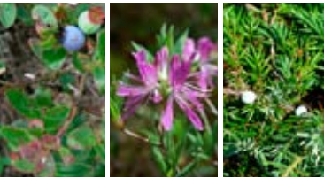
Left to right: lowbush blueberry, rhodora, common juniper