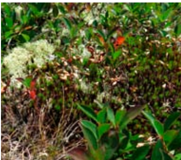
Close-up of Low Elevation Bald