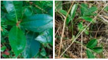
Black chokeberry (L), three-leaved cinquefoil (R)

but common stressors include drought, wind, and fire. Low Elevation Balds, like this one, often follow fire. Fire kills mountaintop vegetation, causing it to release the soil held by its roots. Without roots holding it in place, the soil is more easily washed and blown away. In more sheltered spots like lower mountain slopes and valleys, soil accumulates quickly as lichens, mosses, and small plants help build up organic matter. Though lichens and low plants also establish themselves on barren mountain summits, relentless winds and a lack of moisture make soil accumulation a very slow process.