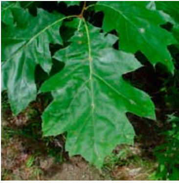
Red Oak leaves