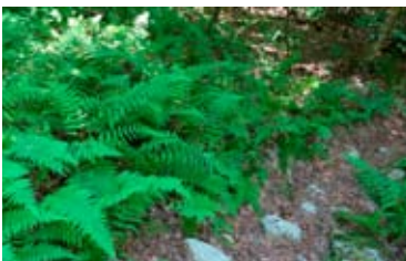
Canada mayflower (top) and hayscented fern (bottom)