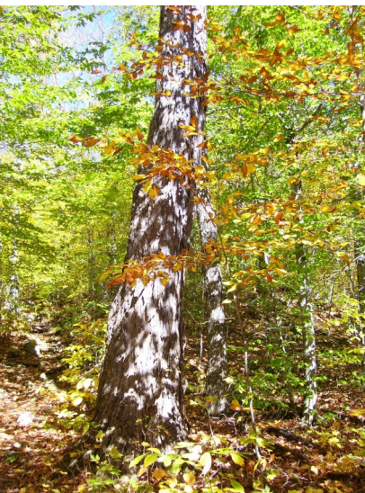
Trees in late successional forest will have a variety of age and size classes.

heterogeneous mixture of fine and coarse grained sediments (even boulders) that are deposited during the melting of glaciers, and which are not washed or sorted by interaction with streams or other water bodies.