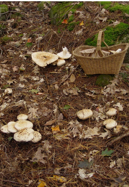
White matsutake is an edible mushroom that is often found associated with Eastern Hemlock. A word of caution: do not collect wild mushrooms for the table without adequate identification skills.

other plant species. Additionally, hemlock trees have a dense canopy which deeply shades the understory, limiting other species from becoming established. These factors lead to the open park-like environment typical in mature hemlock stands and lead some to call these areas ‘hemlock deserts’. While hemlock forests tend to have low plant diversity, they support a variety of fungi including hemlock reishi ( Ganoderma tsugae ), a shelf mushroom with medicinal properties; matsutake ( Tricholoma magniverlare ) and black trumpets ( Craterellus sp. ), both desirable edibles; and the deadly destroying angel ( Amanita bisporigera ). A word of caution: one should only collect wild mushrooms for the table when they have enough experience to correctly identify them.