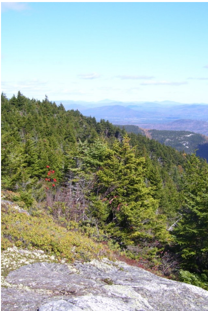
Caribou Mountain's summit is not a true alpine summit, but a mid elevation mix of exposed bedrock, spruce-fir woodland and heath shrubs.

small lesions in healthy trees, incidentally inoculating them with spores of the fungal tree diseases. These fungal diseases eventually kill the tree. Beech, once identified for its smooth grey bark, can now be identified by the many bark disease related boils and lesions that pockmark the bark's surface. Though mature trees are able to resist an infection for many years, they eventually succumb. Once the upper part of an American beech dies, the tree utilizes the reserves in its roots to grow many new shoots. These sprouts will often out-compete other vegetation, and because these sprouts are already infected with the disease, it is unlikely they will become mature enough to flower and fruit. Eventually, American beech will likely become a less common component of northern hardwoods forests.