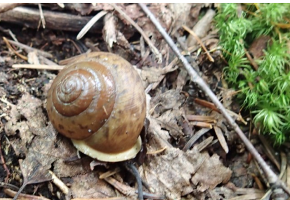
Some land snail species benefit from calcium rich sugar maple logs.