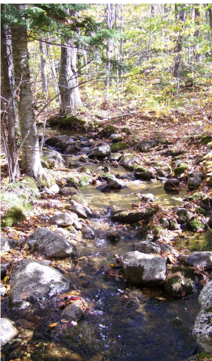
Mud Brook, not looking especially muddy.

The debris fields left behind following the melting of the glaciers, often steep and full of talus, are inhospitable locations for many species. Red spruce, however, which can germinate in narrow rock crevices and which is tolerant of a variety of weather and soil conditions, is able to thrive here. Identified by its short, prickly needles, red spruce has a sub-boreal distribution and is Maine’s most common spruce. Red spruce occurs in mountain environments across the Appalachians, but northern New England, New Brunswick and the Canadian maritimes are the heart of its range where it also occurs in many low elevation settings. The southern slopes of Caribou Mountain are dominated by red spruce and contain mosses and understory plants that prefer the cool microclimate conditions provided by an evergreen canopy. These include three-lobed bazzania liverwort ( Bazzania trilobata ), wood sorrel ( Oxalis montana ), and mountain woodfern ( Dryopteris campyloptera ).