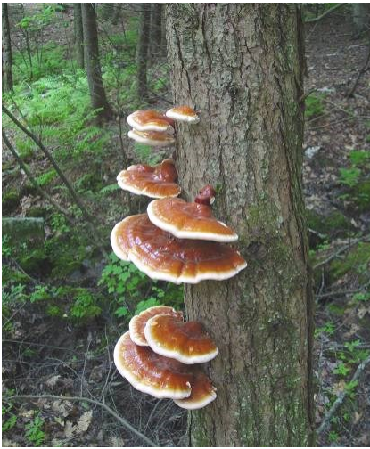
Hemlock reishi is a wood decaying fungus that grows on dead hemlock snags and logs. Reishi is a bitter tasting fungi that is sometimes prepared in teas for medicinal uses.