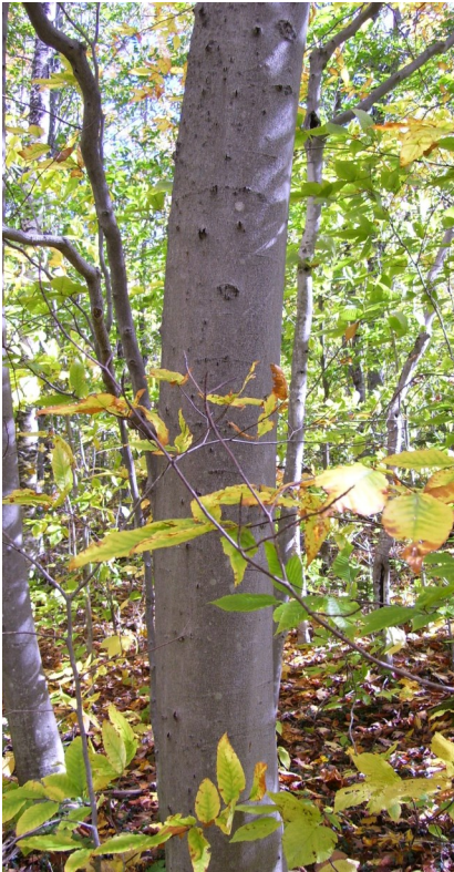
This mature beech is beginning to show signs of beech bark disease on its upper trunk.