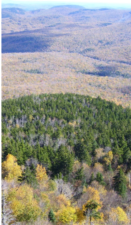
The White Mountain National Forest looks very different today than at its peak of industry.

As today, abundant 19th century timber resources in Evan’s Notch included Eastern hemlock, red spruce and northern hardwoods such as American beech, sugar maple and yellow birch. At the end of the 1800s the demand for hemlock bark, the preferred source of tannins for curing leather, was at its height. Red spruce trees were cut for lumber and hardwoods were more selectively cut and sent to wood turning mills. The town of Hastings had its own wood alcohol and saw mill, and exported the various timber products to Gilead by rail. By 1900 nearly all the accessible old-growth trees were harvested from the valley and the buildup of logging slash was considerable. Many of the streams were choked with silt from soil erosion. In 1903, major wildfires swept through much of the White Mountains National Forest, including Evan’s Notch, burning much of the remaining standing timber. Lum-