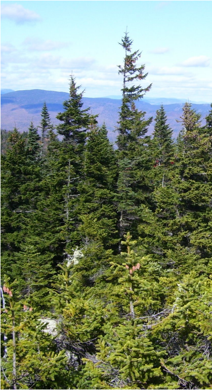
Spruce and fir are highly tolerant of poor soils and can germinate in narrow rock crevices.

A landscape of scoured bedrock and plucked cliffs.