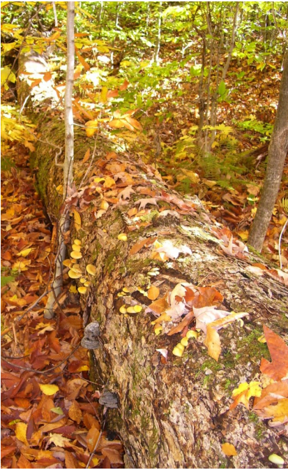
Large coarse woody material provides important habitat for a variety of species.