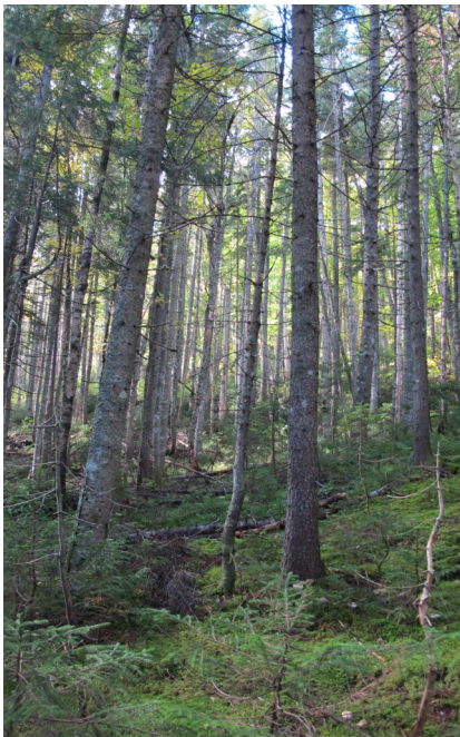
Moist montane spruce-fir forest (above) often will have moist carpets of mosses and liverworts ideal for fungi (below).