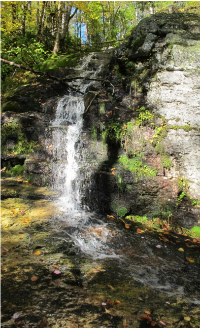
An area of placid waterfall marks the transition between hardwood and softwood forest.